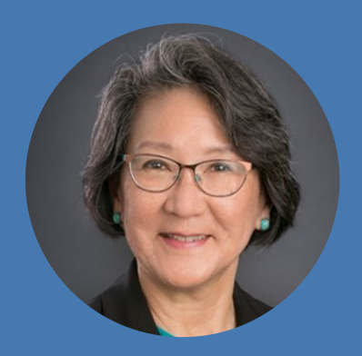
Commissioner Genevieve Shiroma