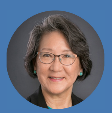
Commissioner Genevieve Shiroma