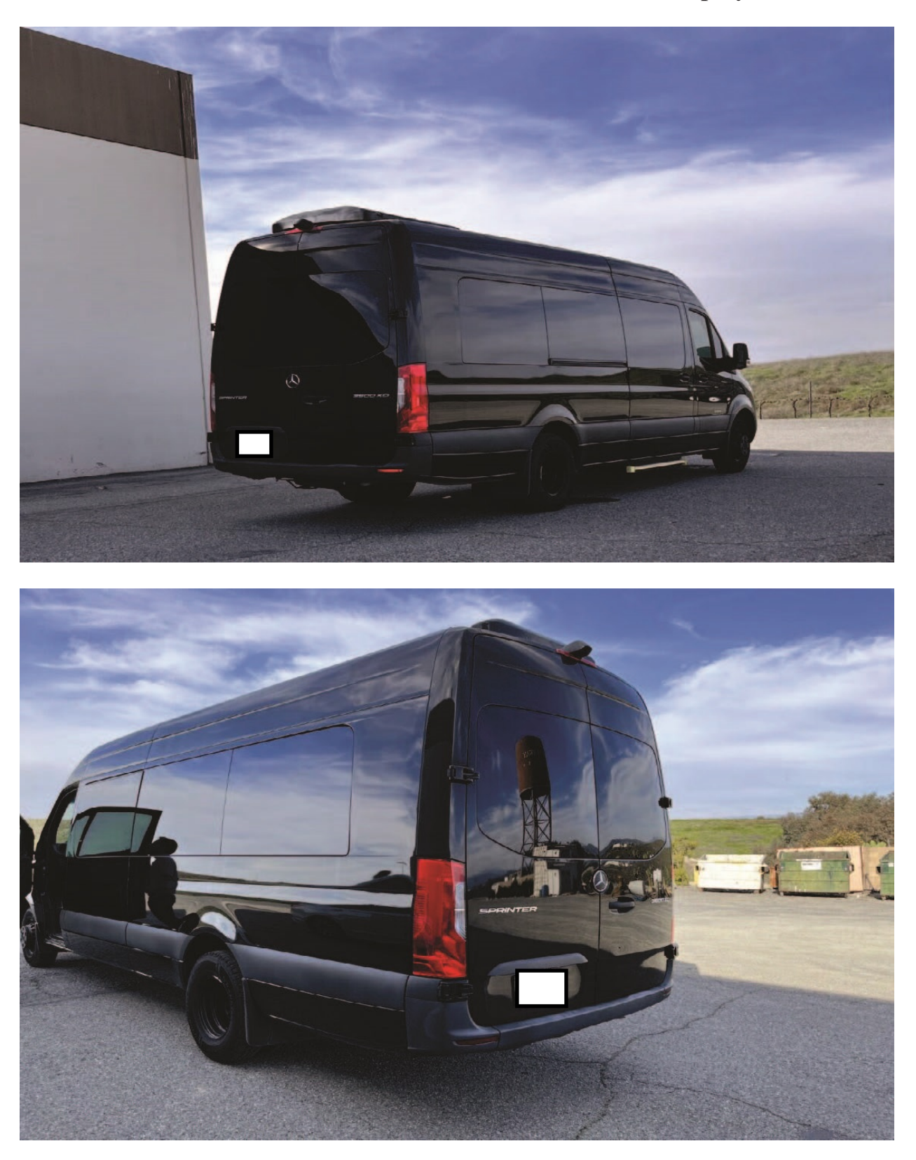
Attachment 6 – Vehicle Without TCP Number Displayed